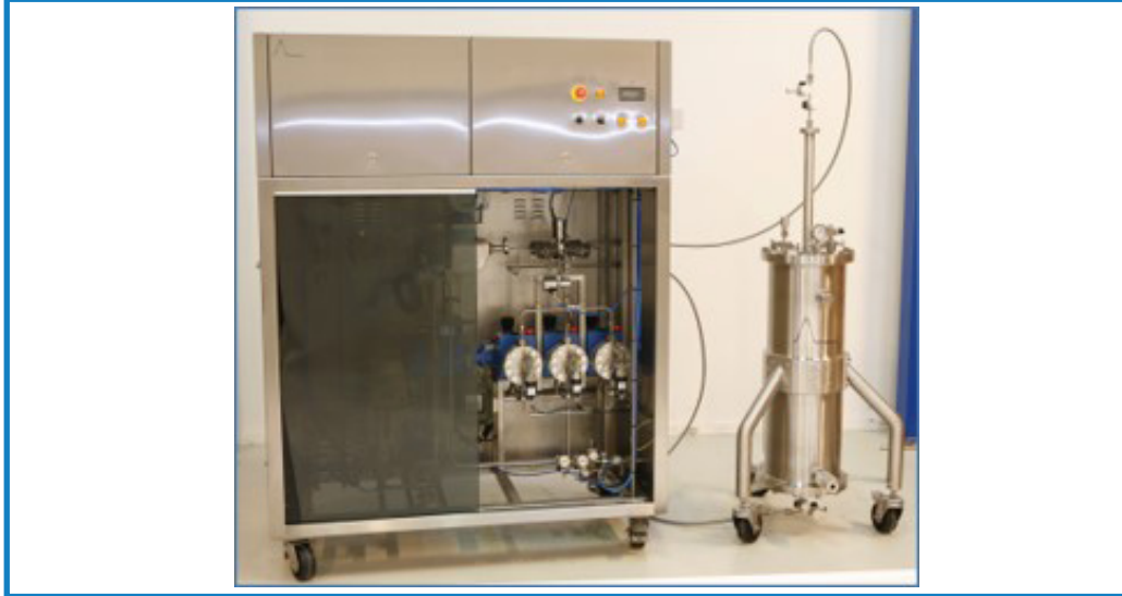
Process Chromatography Systems & Columns